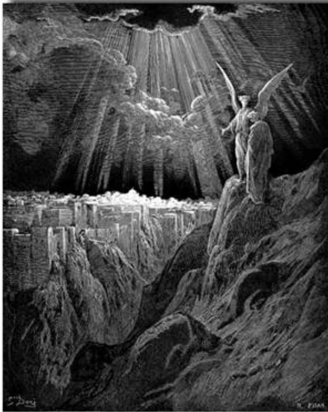
"The New Jerusalem" by Gustave Moreau