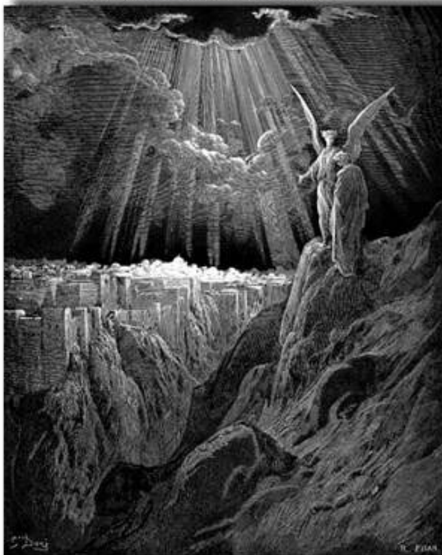
"The New Jerusalem" by Gustave Moreau